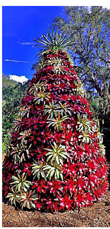
Bromeliad tree from 'Orlandiana', Central Florida B.S.