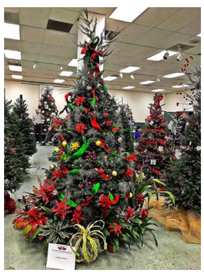
Bromeliad Xmas tree mounted by San Diego BS in Balboa Park