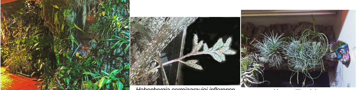
Hohenbergia correiaaraujoi inflorence

Members, especially new members, spent lots