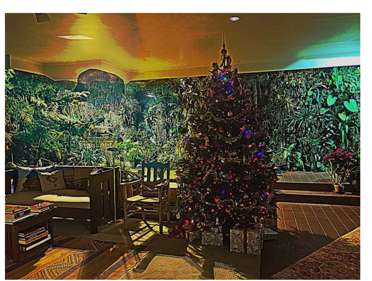
ANOTHER CHEERFUL HOLIDAY PARTY