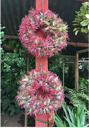
Christmas wreaths of T. ionantha, Nicaragua.